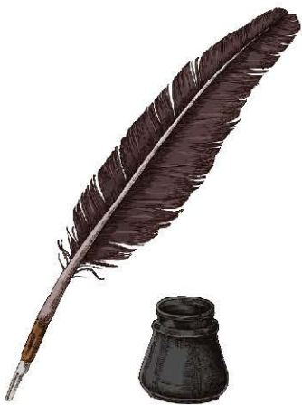
erihhtʔis tué erihhtʔis chené