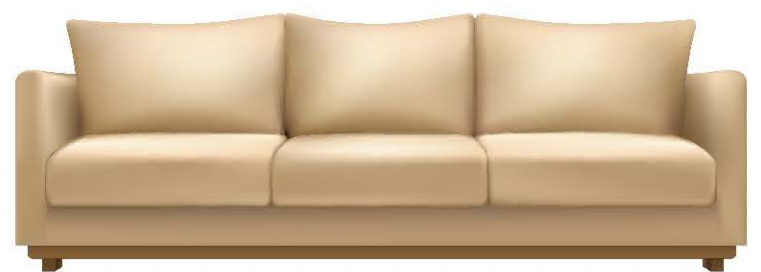
dahchené chogh Couch